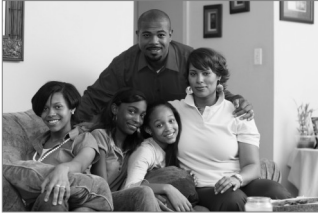
According to Carers UK, "Three in five people will become a Carer during their lifetime."