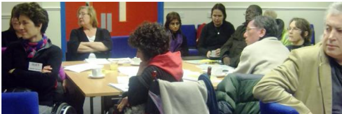
DASL members listen to debate at the AGM

in March. We have also had a 10% reduction in the funding for our Direct Payments Support Service. Despite this, and the uncertainties which lie ahead, we are maintaining our key services to disabled people and carers and will continue to do our best for existing and new clients