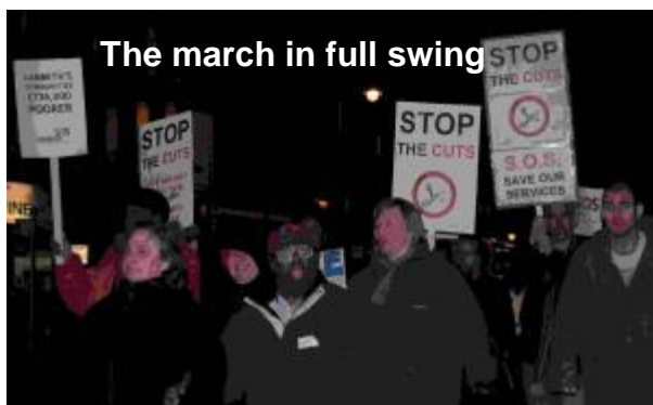
The march in full swing

Lambeth SOS was set up in January 2007 by a group of local voluntary and community organisations, including DASL, which work with vulnerable adults and carers. Over the past two months, it has been coordinating the campaign against the Council's cuts proposals, building support from users, carers and others who are concerned at the damage the cuts will do. The Lambeth SOS website has been a vital part of the campaign and it will continue to be updated with news and information. Visit www.lambethsos.org.uk regularly to find out what is happening.