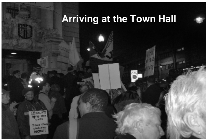
Arriving at the Town Hall

Pressure from Lambeth SOS has forced the Council to delay a final decision on the eligibility and charging proposals until June at the earliest. It has now extended the consultation period on these proposals from April 16th to June 4th. Users and carers should continue to make their views known. Ring the Council on 020 7926 8200 or visit www.lambeth.gov.uk/Services/HealthSocialCare/ACSBudget.htm to