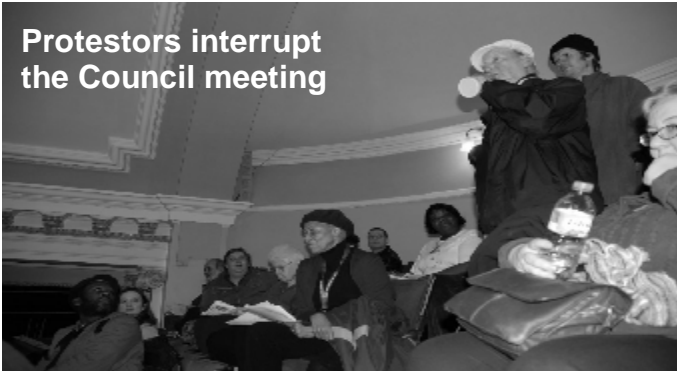
Protestors interrupt the Council meeting