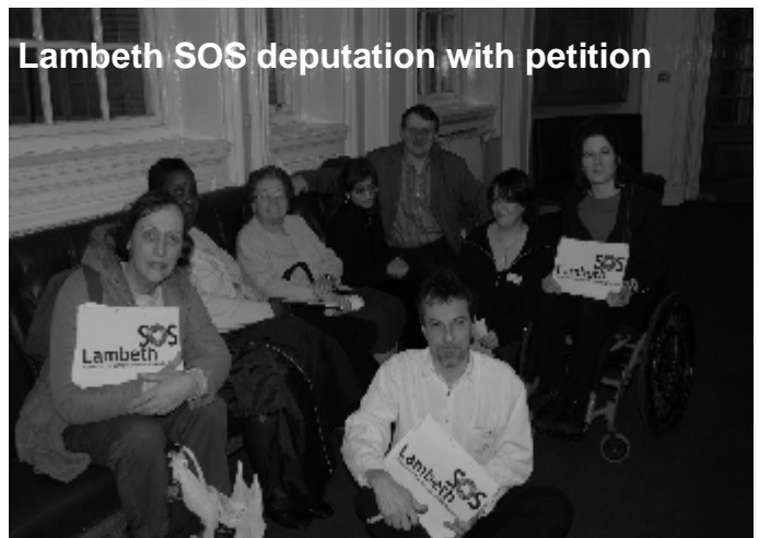
Lambeth SOS deputation with petition