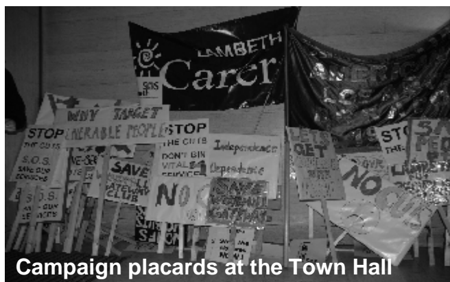
Campaign placards at the Town Hall